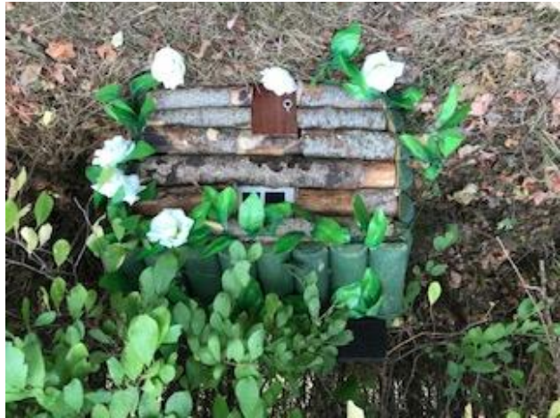
(above: animal homes created along the woodland walk)